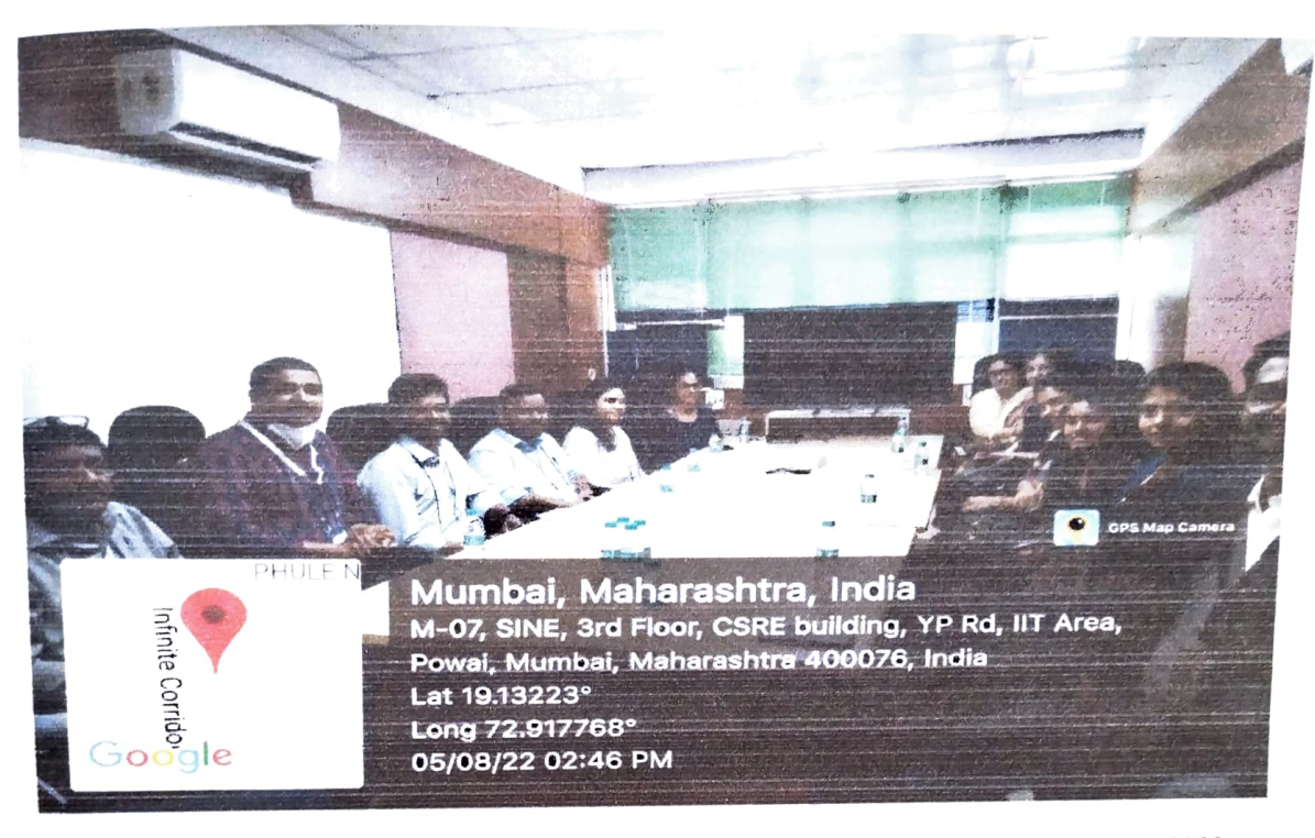
Mentor-Mentee Scheme 2021-22 - I&E exposure visit cum training program : 5th& 6th August 2022